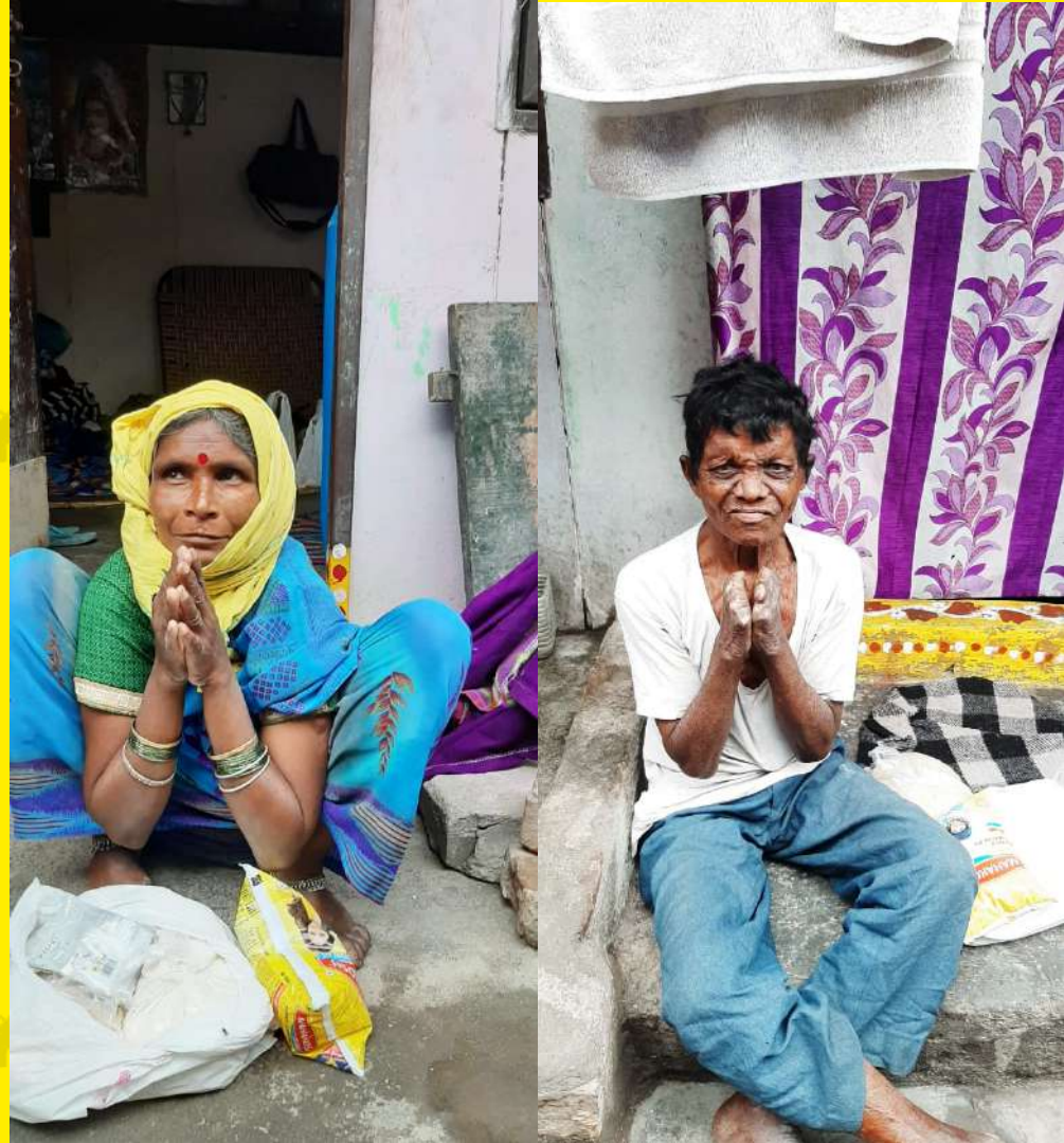
Photo: members of community in the Kathputli colony awaiting arrival of food donations (April 2020)

By providing financial assistance and a global support network to community organisers in these fragile contexts, we are building resilience and supporting community driven solutions for sustainable development in places too often left behind by global humanitarian aid and development communities.