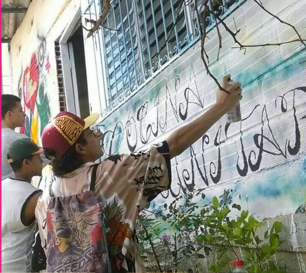
Photo: Old Guns finishing painting their new community kitchen