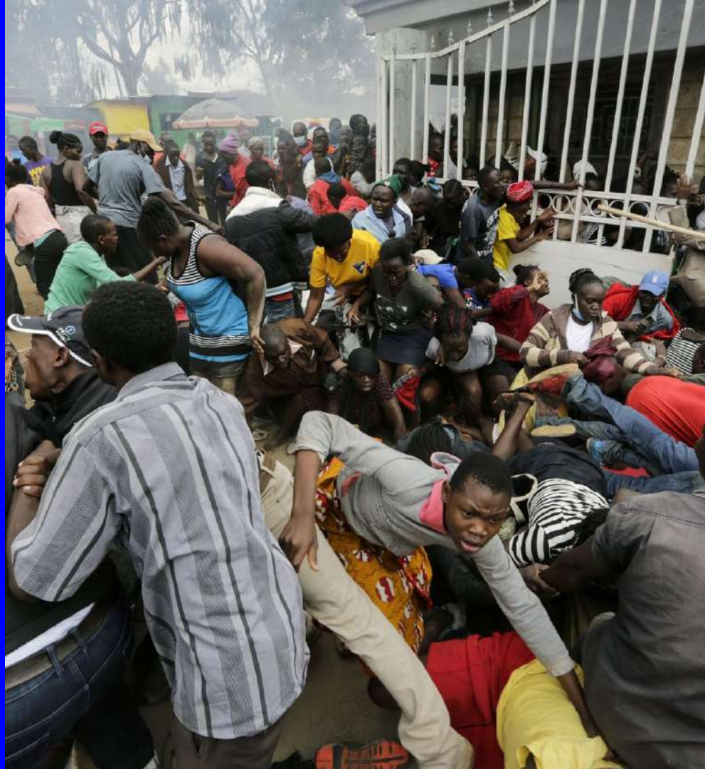
Photo: People surge for food aid during lockdown in Nairobi (April 2020)

‘A young boy was also shot by police at the balcony of his home in Kiamaiko, Nairobi, because ‘he was out during the curfew’ which seems like a dark irony that a citizen was killed by police who were ensuring he was indoors to protect him from COVID-19. Questions still remain unanswered on why the government is charging for treatment of corona-related ailments.’