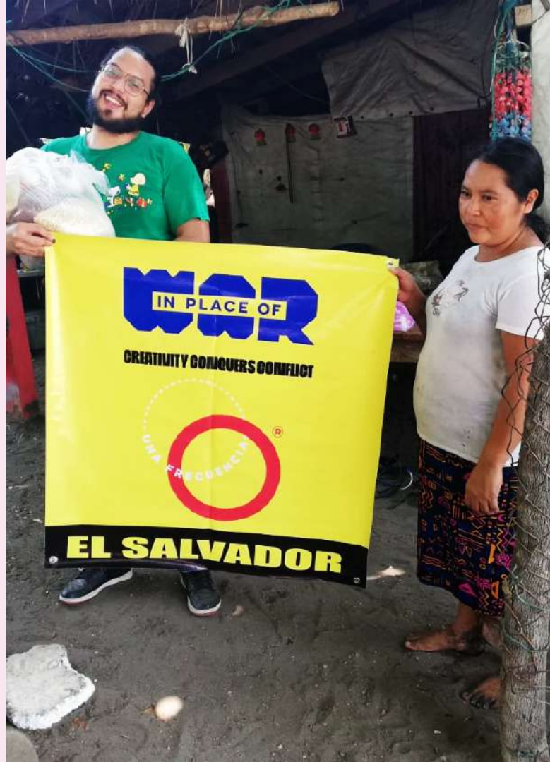
Photo: In Place of War Change-Maker in El Salvador distributing food parcels to vulnerable families (May 2020)

A small panel from the In Place of War Board and team reviewed applications, selected 27 recipients, and funds were distributed, having immediate impact. The overall process took only two weeks .