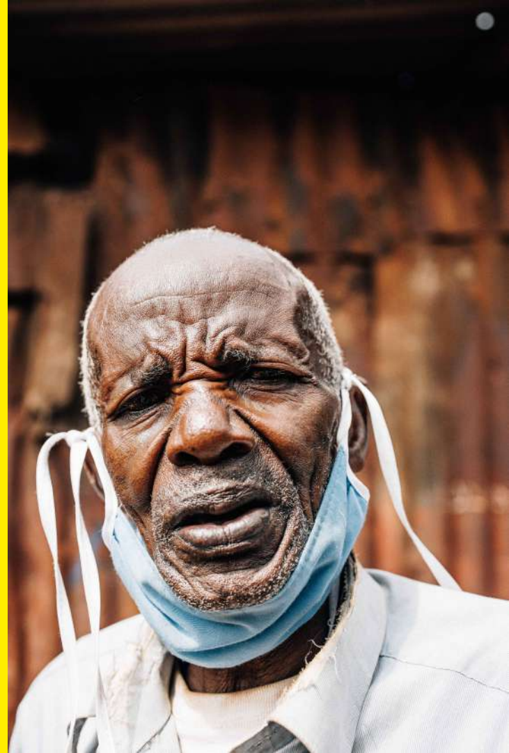
Photo: Kenyan Community elder photographed by IPOW change-makers 'Greenstring Network' (May 2020)

We are seeking $150,000 to support an additional 100 grants across 26 countries, to not only continue providing emergency food and support, but to also begin addressing other longer-term community vulnerabilities as the crisis continues.